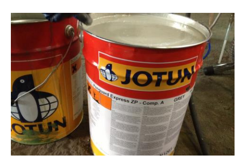
GRACO Distributor LLC «General Engineering», Russia, Moscow, Kirpichnaya st 32